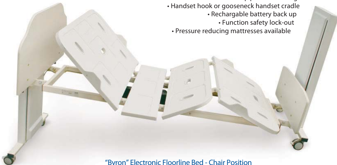
"Byron" Electronic Floorline Bed - Chair Position