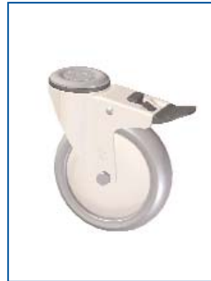
4 locking bearing castors