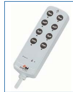
High quality full function handset