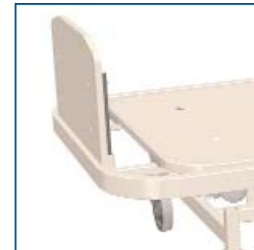
Safe rounded corners